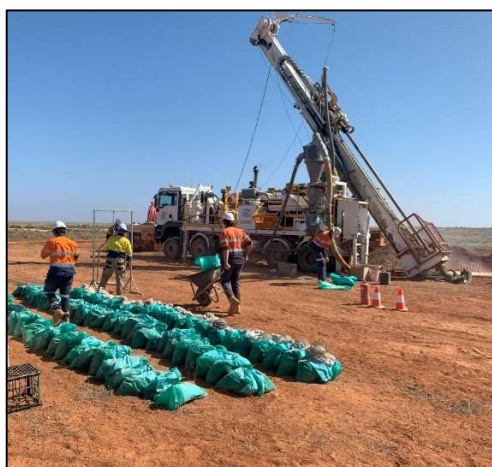
Figure 1: Sampling from the final hole (RCFO24011) in the 2024-H1 program.

These resources have the potential to act as an early feed source for the Hawsons project and help to further improve the Project's cash flow during the first critical years of operation.